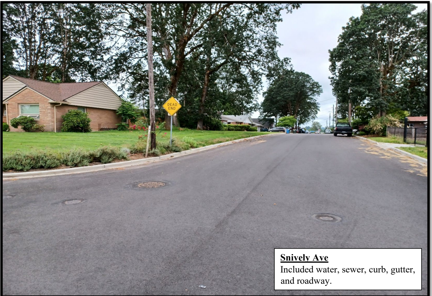
Snively Ave Included water, sewer, curb, gutter, and roadway.