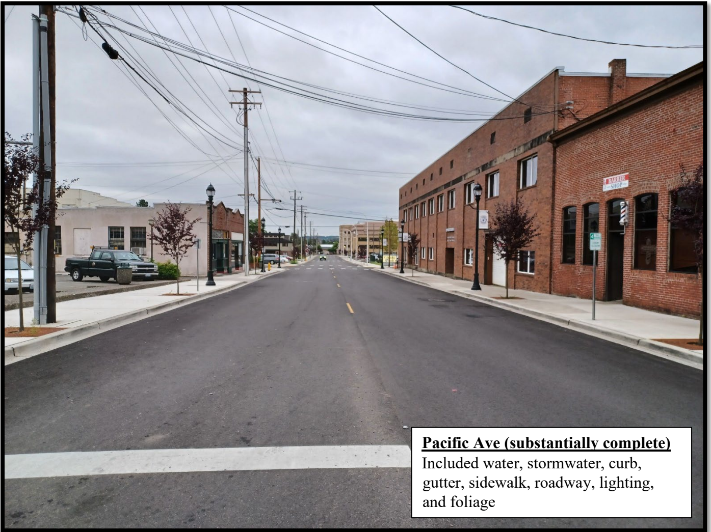
Pacific Ave (substantially complete) Included water, stormwater, curb, gutter, sidewalk, roadway, lighting, and foliage