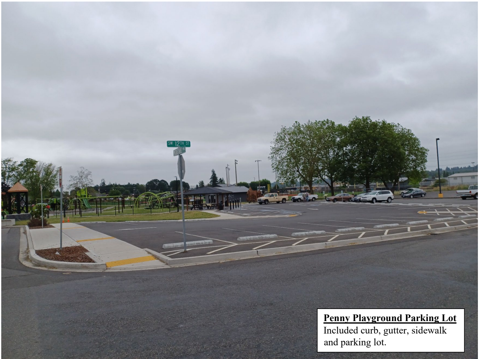
Penny Playground Parking Lot Included curb, gutter, sidewalk and parking lot.