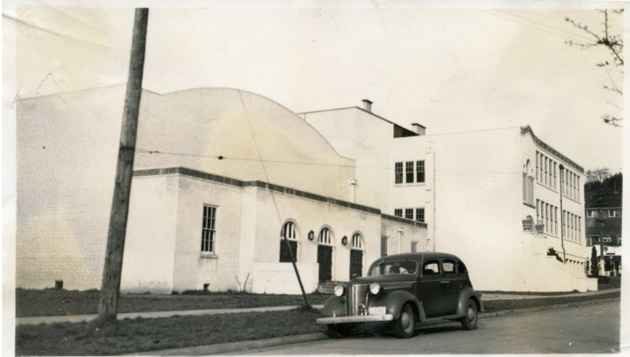
Figure 10 R.E. Bennett School, West and South Elevations, 1939