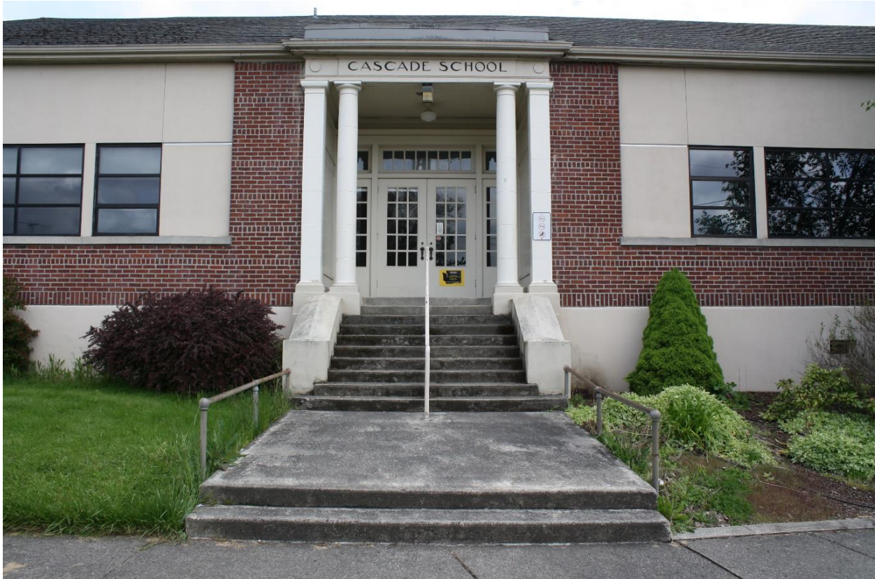
Figure 2 North Elevation Entry, View South

The easternmost secondary entrance is also accessed via a short concrete stair. The entry is recessed and below a simple cornice and unadorned frieze with flanking pilasters. The entry door is similar to other entry doors and has a paired multilite door with multilite sidelites and transom (Figure 2).