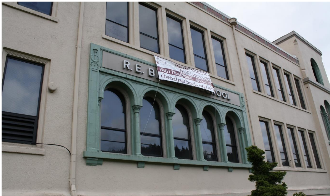
Figure 3 East-Elevation Focal Window, Facing West

Additional architectural detailing includes a simple cornice between the first and second floors, ornamental brickwork facing along the upper reach of the parapet, and beveled corners on the third-floor level of the towers. At either end of the façade a panel with relief sculpture depicts elements that include an open book, globe, and torches. A repetitive geometrical design forms a rectangular border around the depiction on either panel.