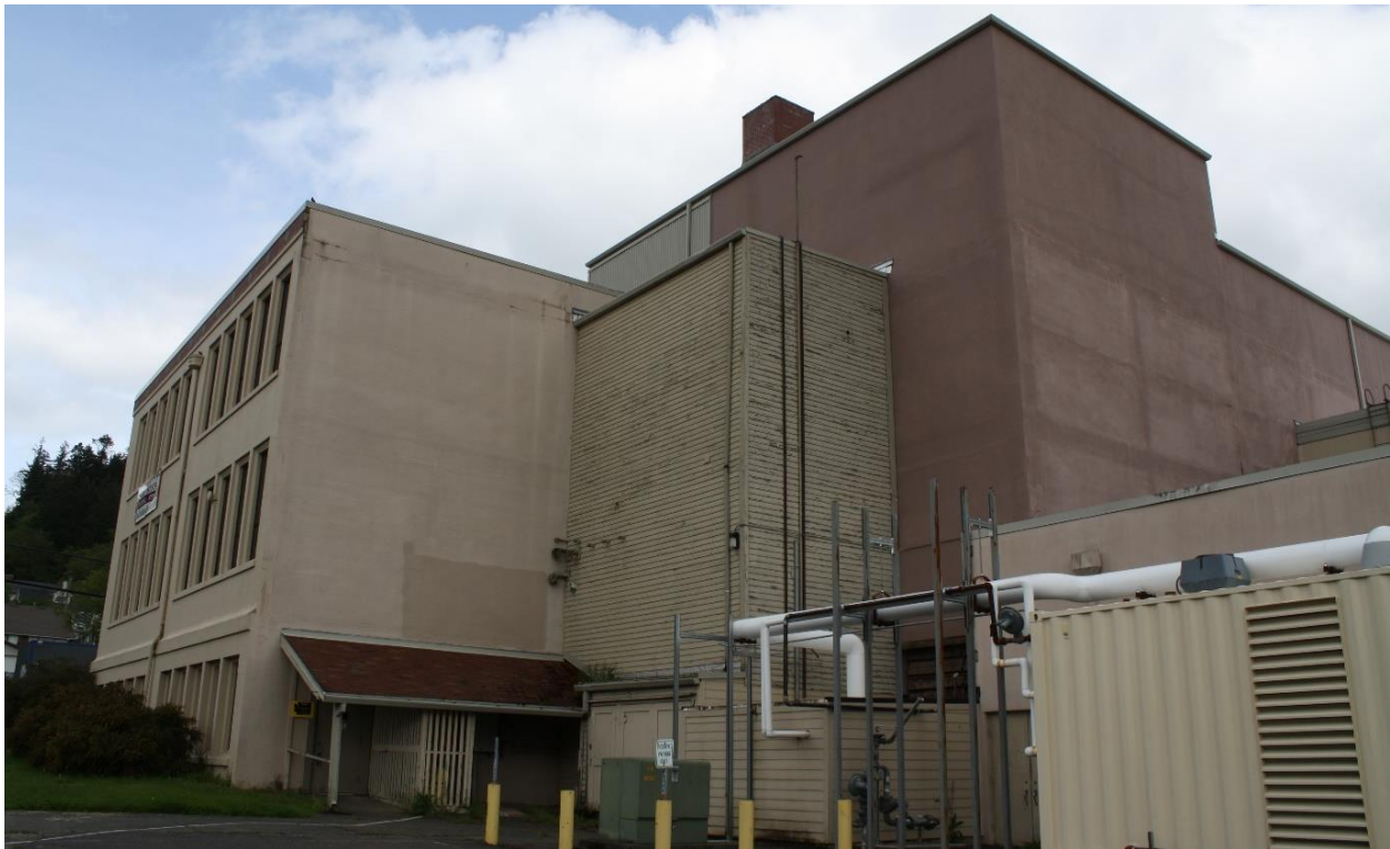
Figure 5 Overview of North and West Elevations of 1928 Building, Facing East

The rear of this section of the building is even sparser. Where it is not obscured by additions, the west elevation is characterized by almost uninterrupted expanses of stucco, and at one location, horizontal wood-plank siding. A notable exception occurs along Southwest 2 nd street, where a rear-facing ground-level entrance is sheltered by a broad pent overhang. The door here is of heavy wood construction with a small eye-level window. To the right of the entrance, a wood-slat screen separates a small utility area. South of the entrance is a series of three utility doors, one single, the others doubled. All three doors are of similar wood-panel construction. On the opposing end, a ribbon of three one-over-one windows punctuate the third floor.