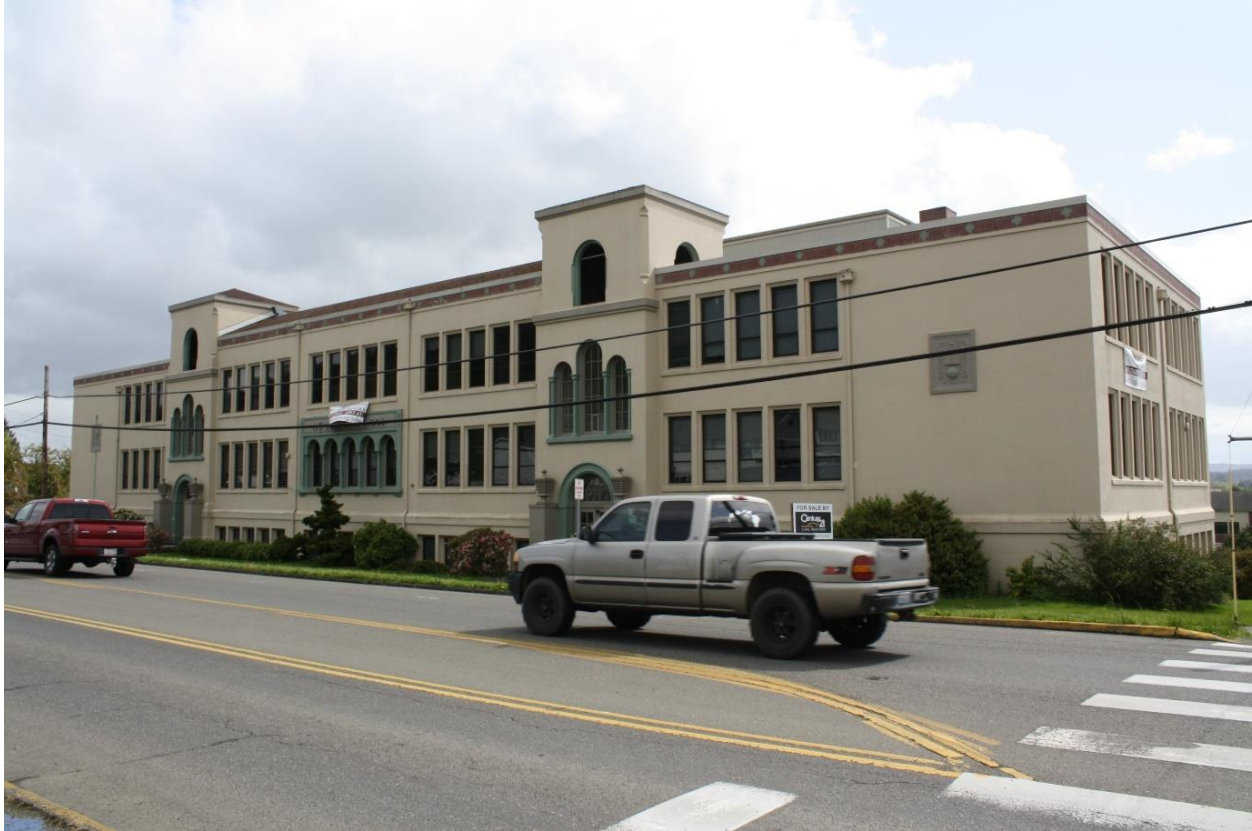
Figure 1 R.E. Bennett School, East and North Elevations, Facing South