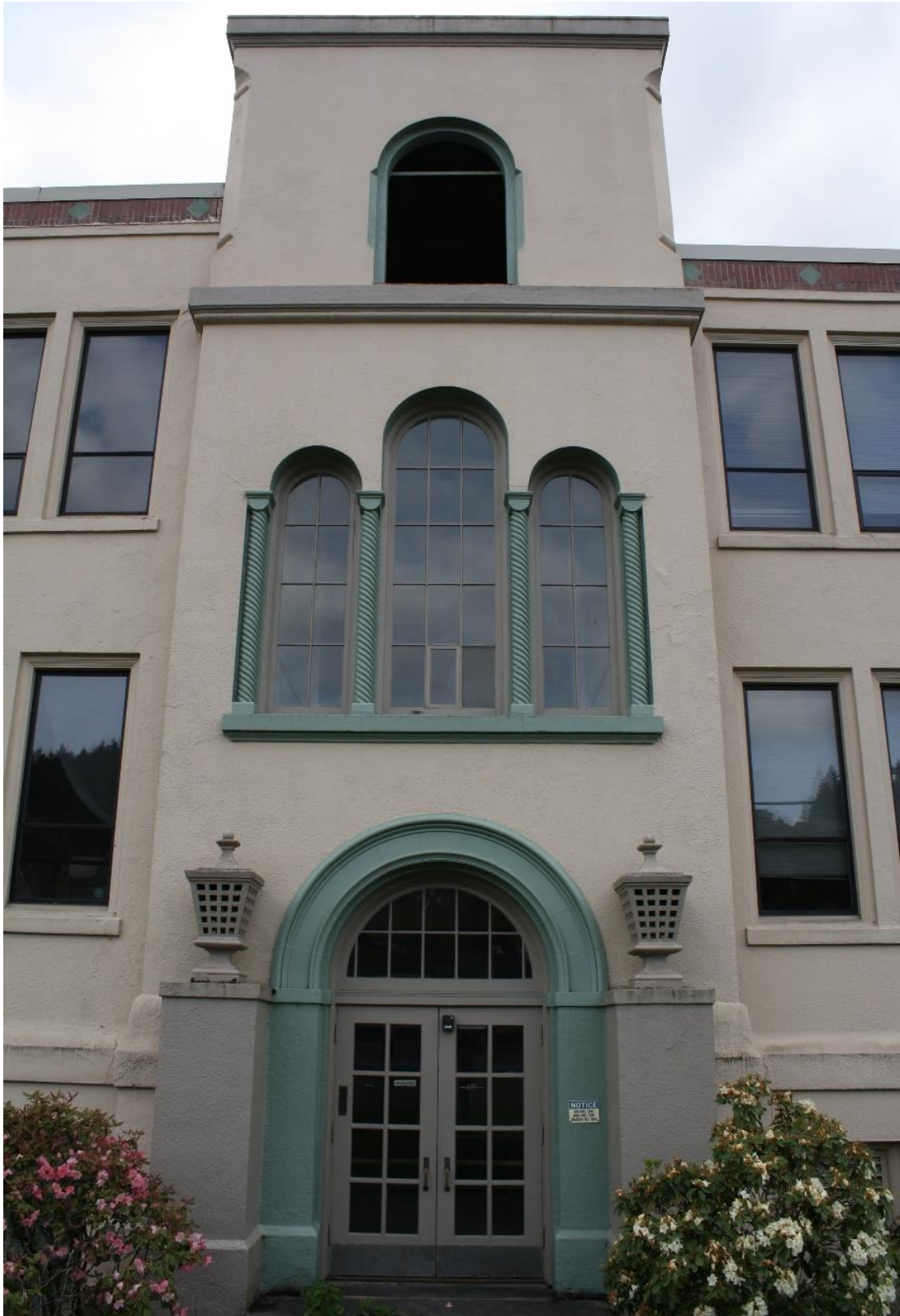
Figure 2 East-Elevation Entryway, Facing West