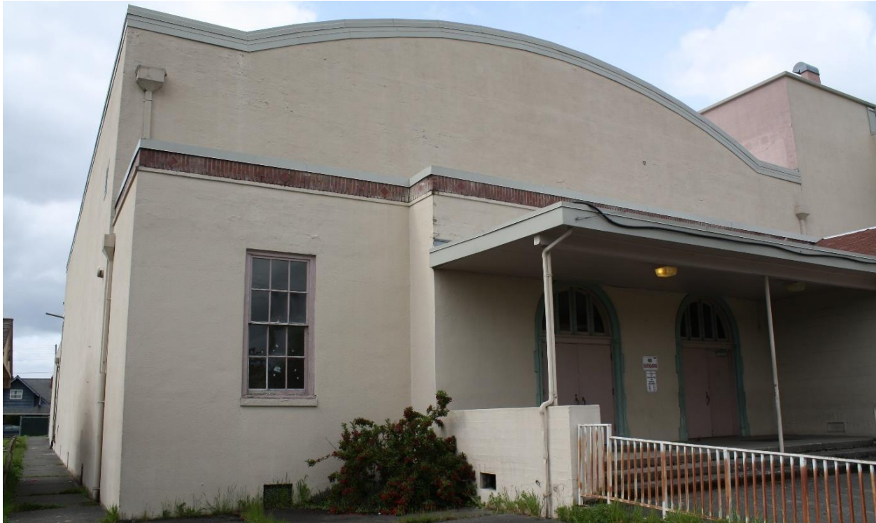
Figure 6 South and West Elevations of the Gymnasium, Facing North

exterior walls are uniformly stuccoed, though the stucco on the taller portion of the building is non-original, obscuring a formerly exposed brick exterior.