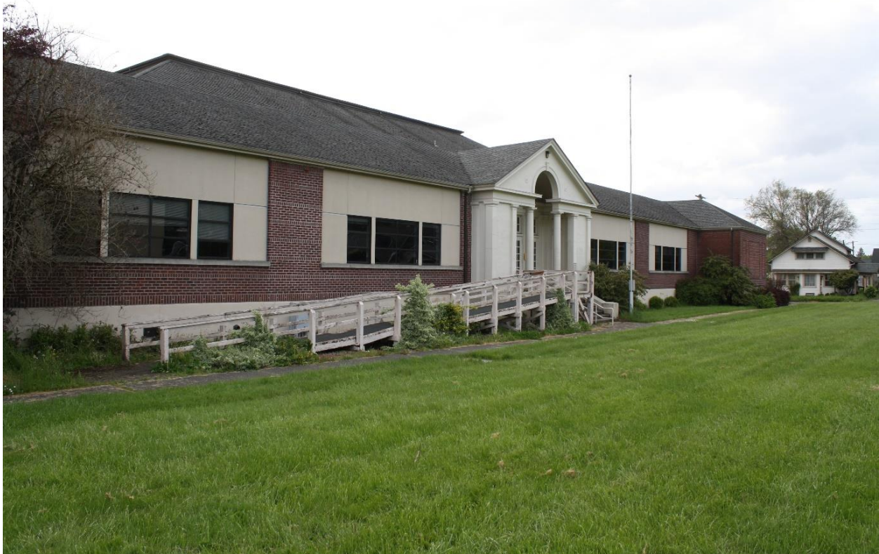
Figure 1 Cascade School, View Northwest

Cascade School is a one-story over basement brick clad building in common bond, with a concrete base and a cross-hipped asphalt roof. Built in 1922, the building has a U-shaped footprint with a central block portion and extending north and south wings, and features Neoclassical Revival architectural elements.