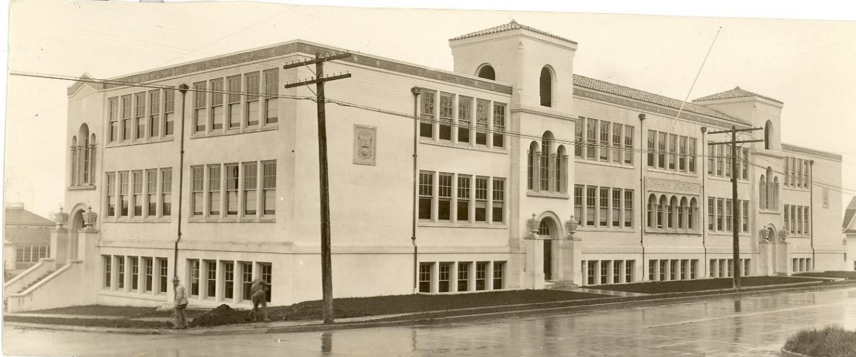
Figure 9 R.E. Bennett School, East and South Elevations, 1928

share of the cost of building the new gym. Federal subsidies accounted for the remainder of the costs, which totaled about $35,000. 41