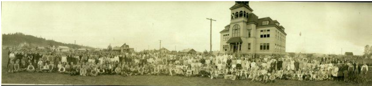
Figure 5 East Side School c. 1922

In the following years, Chehalis's school system began to grow to respond to the expanding population. Chehalis's first all-grade school, known as East Side School, was a wood frame building built in 1889 at a cost of $10,000 which was raised from the sale of selling eight lots. 18 The school, located downtown on Market Street, was organized with elementary school classrooms on the first level and the high school classrooms on the second floor. 19 The school was moved to a lot owned by the school district on Cascade Avenue between Second and Third Streets in about 1909 (Figure 5). 20 By 1922 it was known as the South Ward School, then Cascade School, and it was demolished in 1926. 21