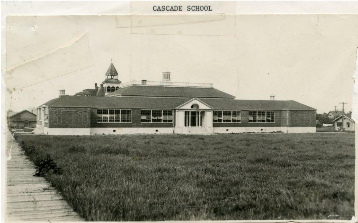
Figure 6 Cascade School, c. 1922