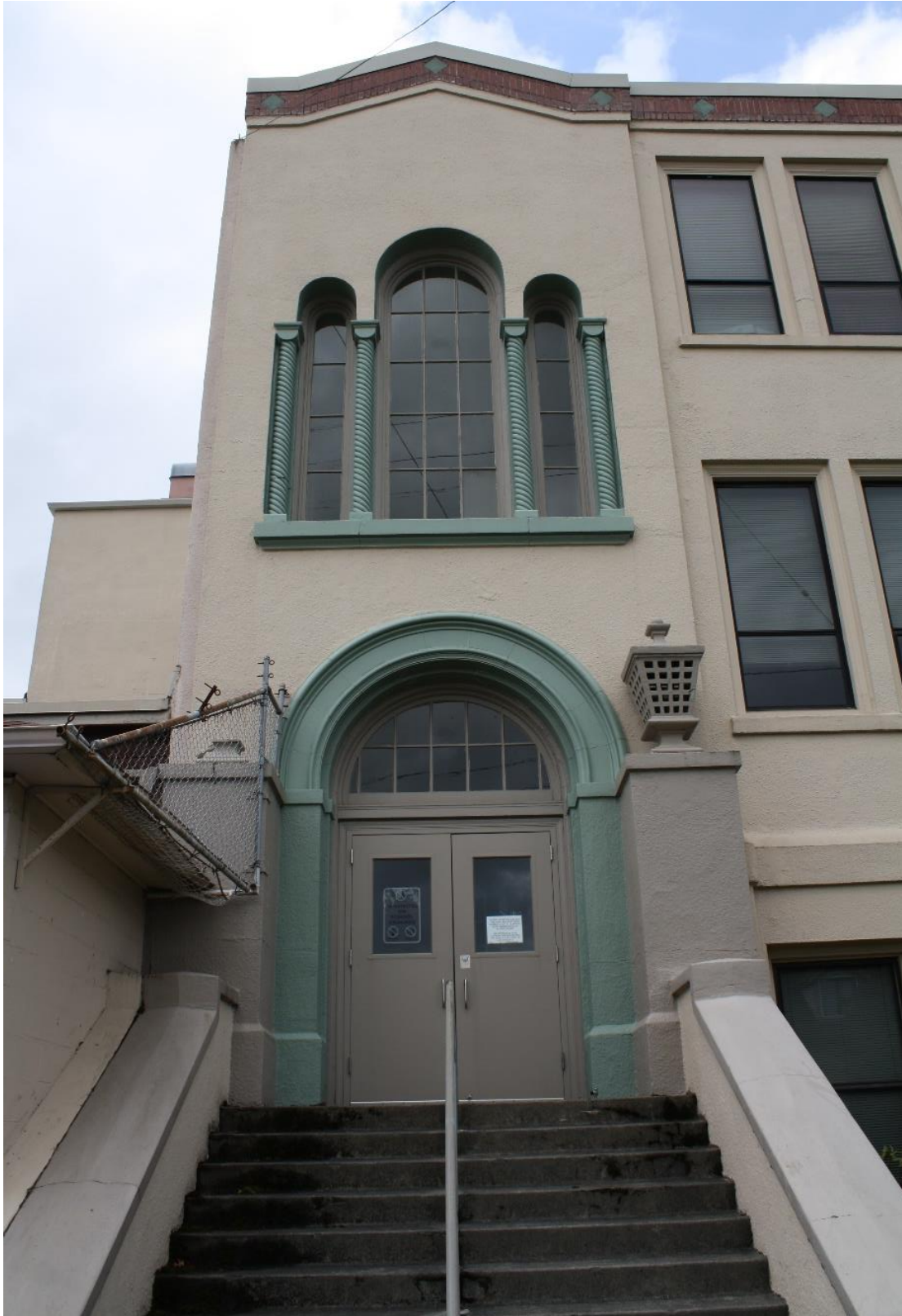
Figure 4 South-Elevation Entrance, Facing North