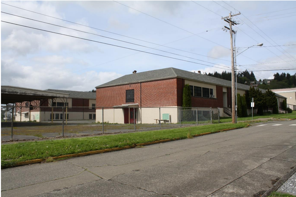
Figure 4 West Elevation, View Northeast

The remainder of the elevation is comprised of the courtyard-facing elevations of the north and south wings. The north and south wings repeat the same pattern and extend for two bays from the central block. As described on other elevations, the first-floor level is brick clad in common bond and is stucco at the basement level. Each bay is similar to those described on the street-facing elevations and includes two large openings with a concrete sill and partially infilled with stucco panels and modern replacement windows. At the basement level, which is fully visible at this portion of the elevation features four single windows at each bay and aligns with window opening above. The westernmost bay of south wing elevation features a larger window opening at the first floor and basement levels. There is a single man door entry topped with a flat awning at the end of each wing, where they meet the central block.