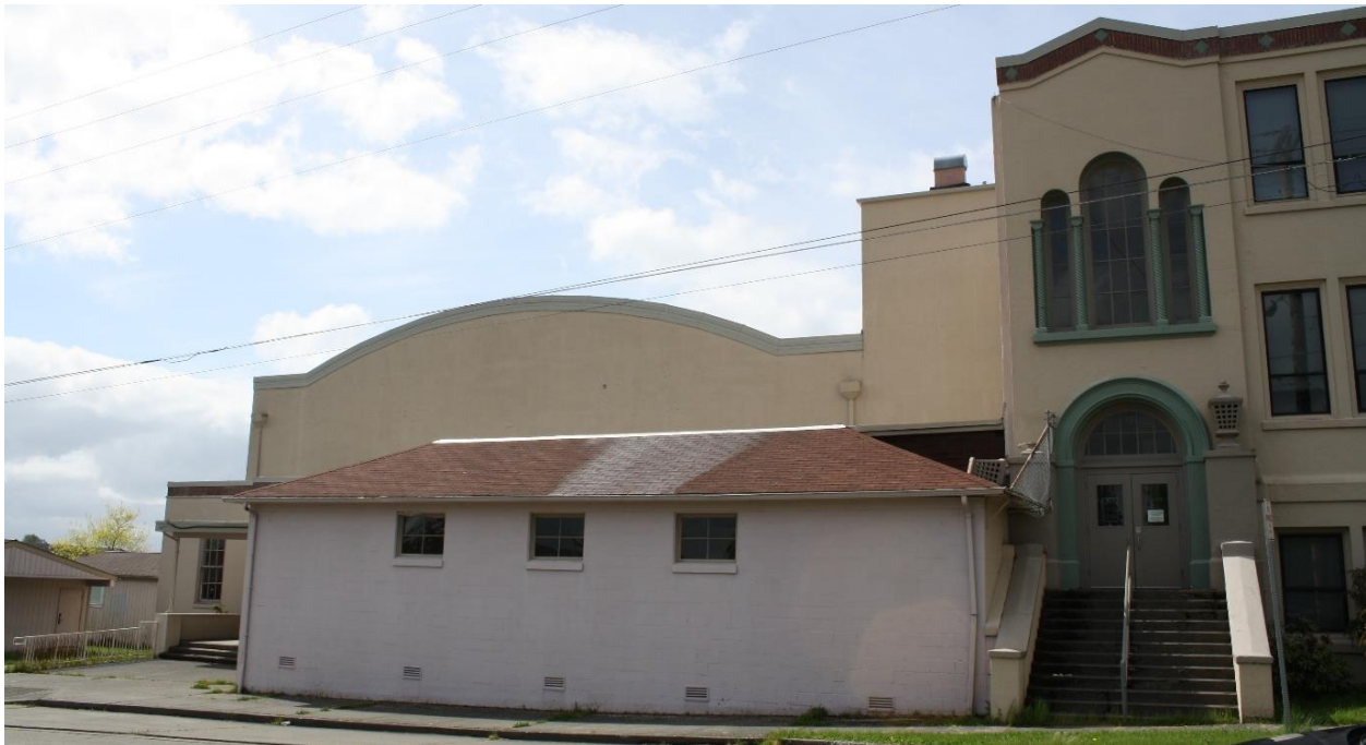
Figure 7 South Elevation of Cafeteria Addition, with Portions of 1928 Building and Gymnasium, Facing Northwest

The east elevation extends from the addition's junction with the original building. Essentially featureless, most of the wall is obscured by the adjacent solid balustrade of the 1928 building. A diagonal feature fills what would otherwise be a few inches of space between the balustrade and the addition's exterior. The west elevation faces the Gymnasium's porch. Aside from a single floor-level vent, the wall lacks openings or other features. The entire north side of the addition abuts the gymnasium.