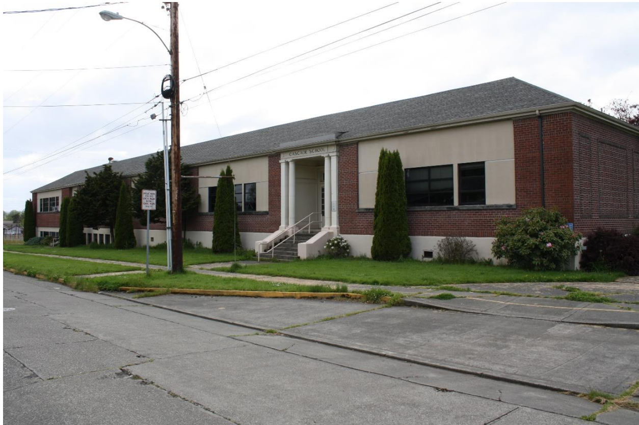
Figure 3 South Elevation, View Northwest

The building’s south elevation mostly repeats the same pattern described on the north elevation. Similar to the north elevation, the basement level at the south elevation includes windows at the easternmost bays. The easternmost entry at the elevation is simpler than those previously described and does not include a cornice details or pilasters. Furthermore, the entry doors are simpler in design and have paired half-lite doors with simple transoms above. The last bay at this elevation is also differentiated from other openings in that it is larger at both the basement level and the first-floor level, suggesting this portion of the building is a later addition (Figure 3).