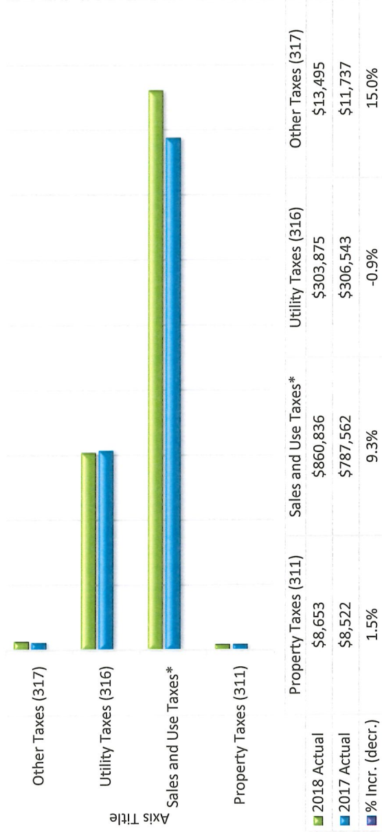
City of Chehalis Year-To-Date Tax Revenues by Source For the Periods Ended February 2017 & 2018