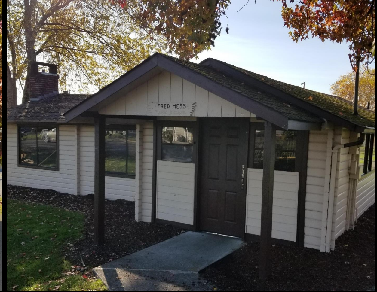
Recreation Park – Landscaping Around Buildings