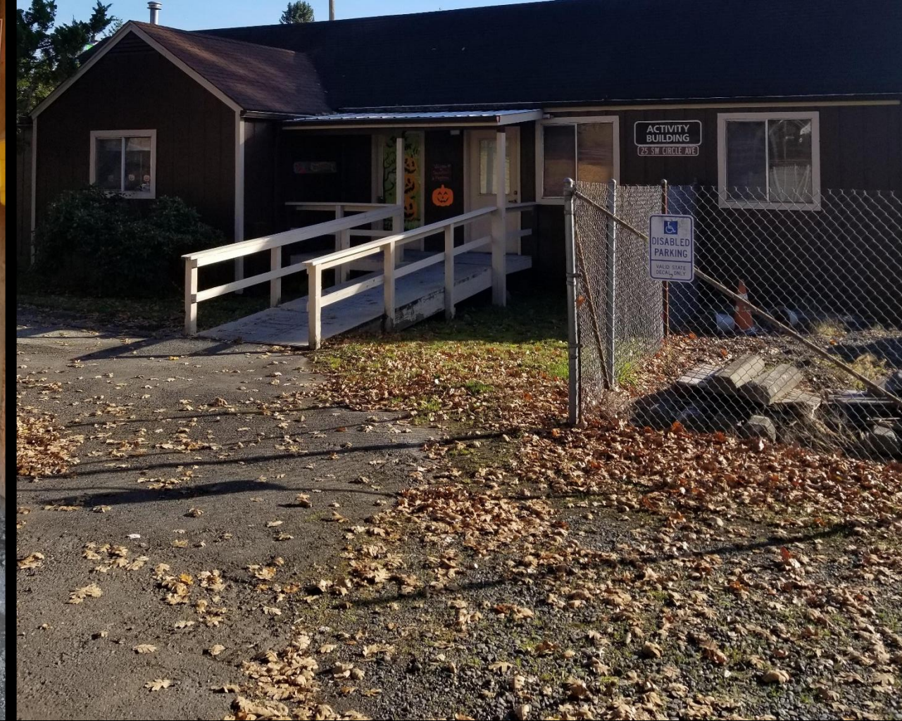
Replacement of Roof and Addition of Concrete Slab at Preschool Building/Carpenter Shop