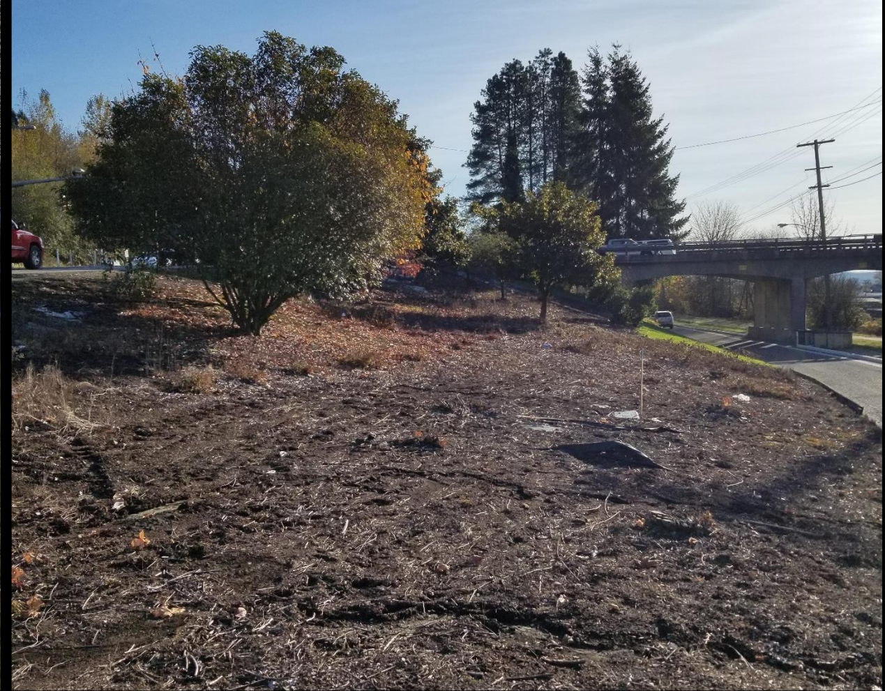
National Avenue – City Entrance Landscaping