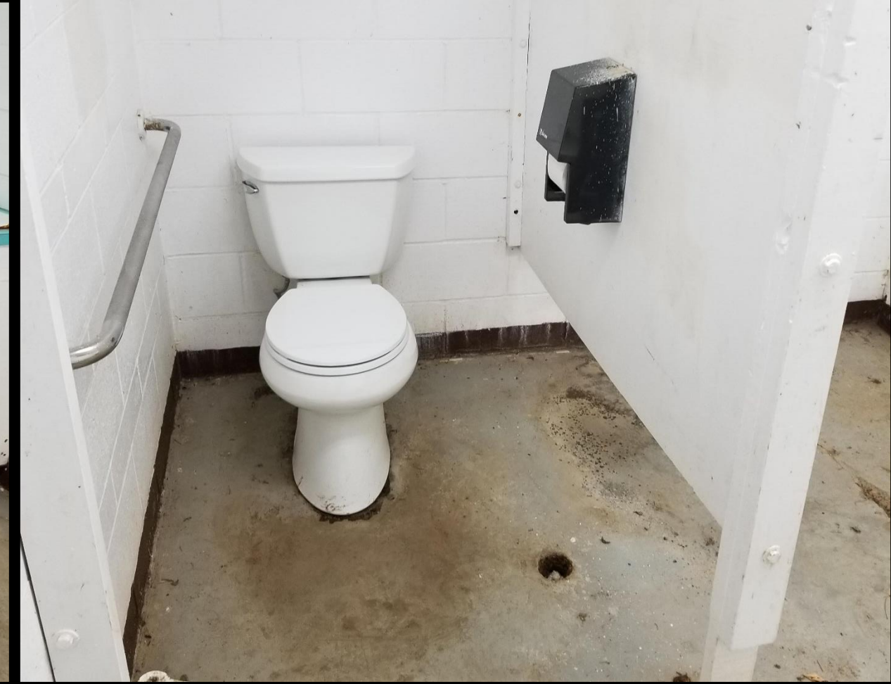
Stan Hedwall Park – Upgrade of Center Restroom Facility