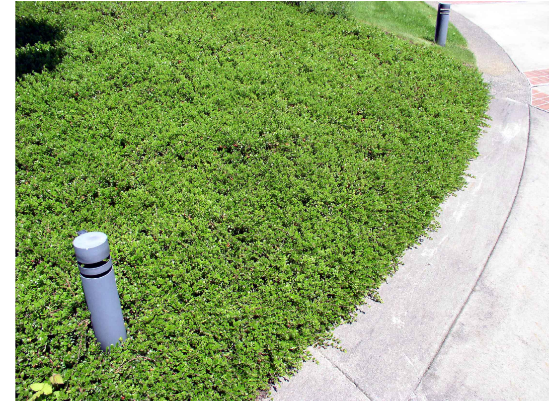
ARCTOSTAPHYLOS UVA-URSI 'BIG BEAR' BIG BEAR KINNIKINICKCOTONEASTER