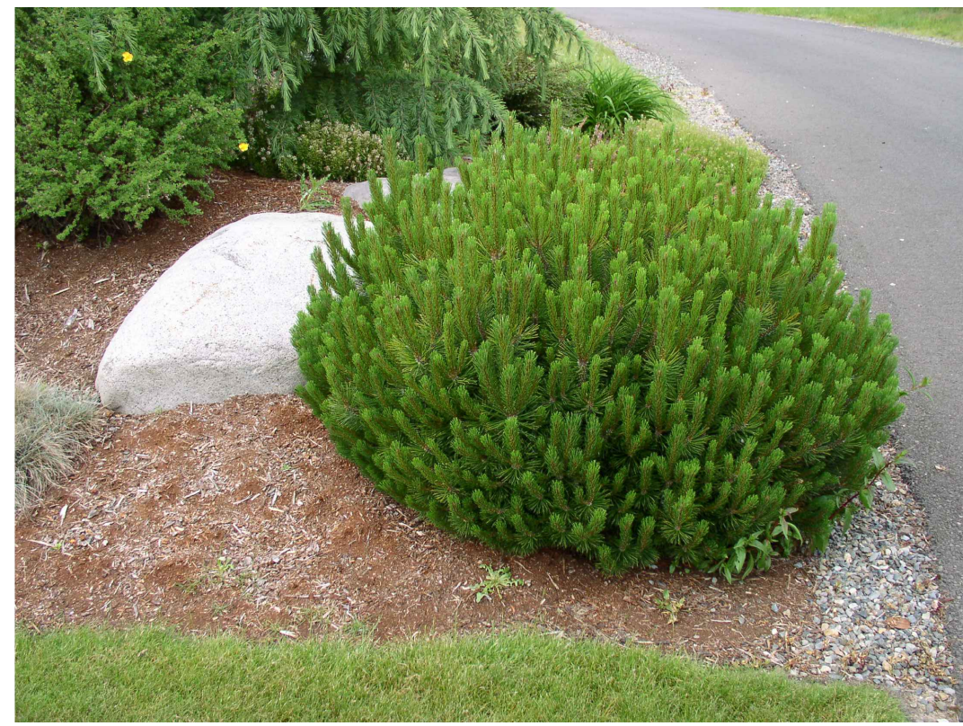
PINUS MUGO MUGO PINE