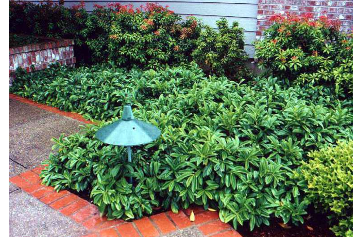
PRUNUS LAUROCERASUS 'MT. VERNON' MT. VERNON LAUREL