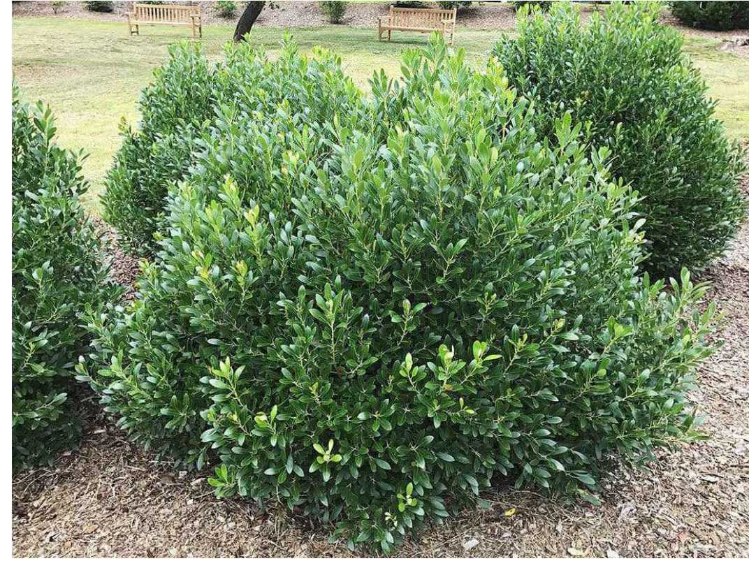
ILEX GLABRA INKBERRY HOLLY