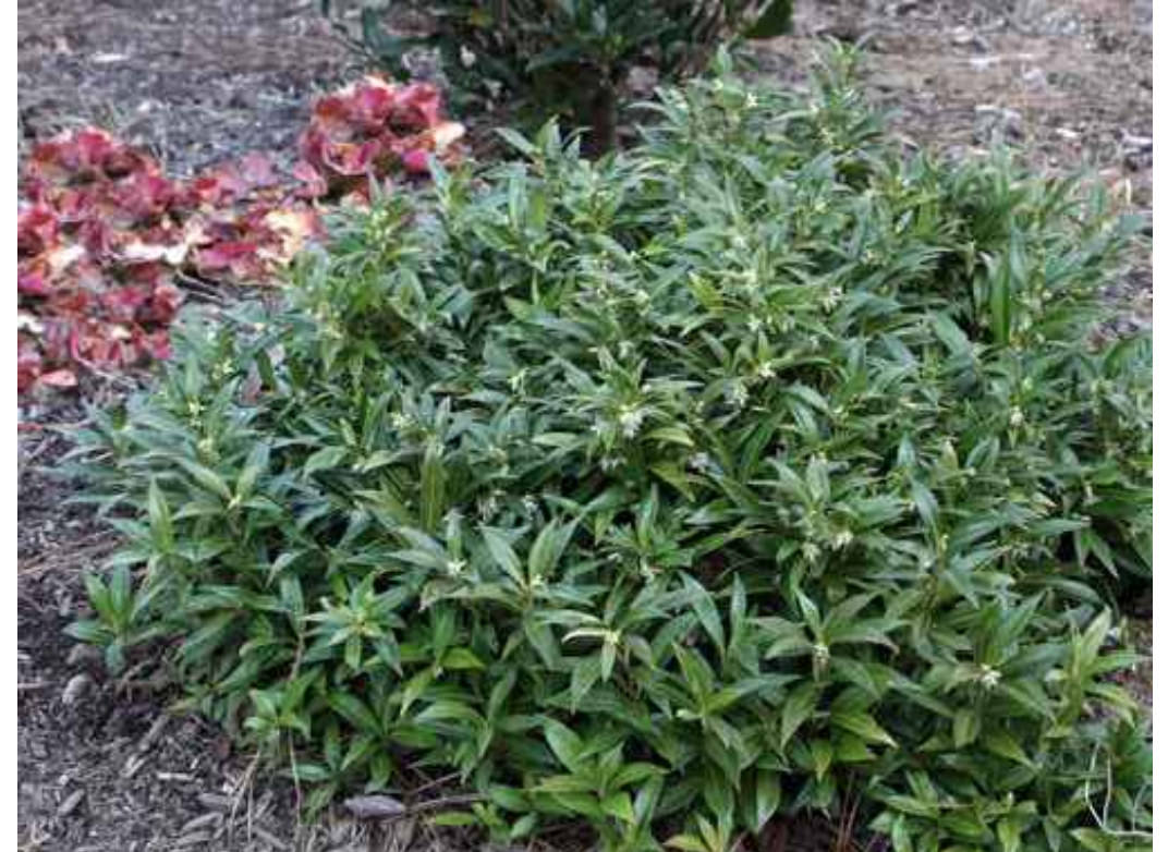
SARCOCOCCA HOOKERIANA SWEETBOX