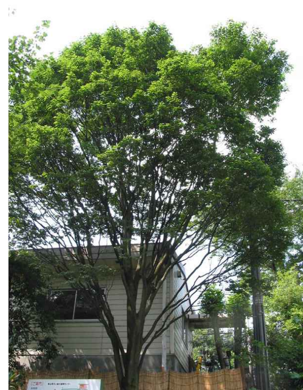
ZELKOVA SERRATA 'GREEN VASE' GREEN VASE SAWLEAF ZELKOVA