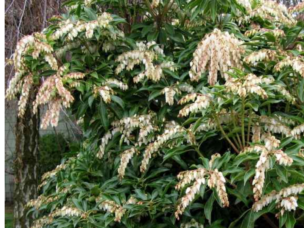
PIERIS JAPONICA JAPANESE PIERIS