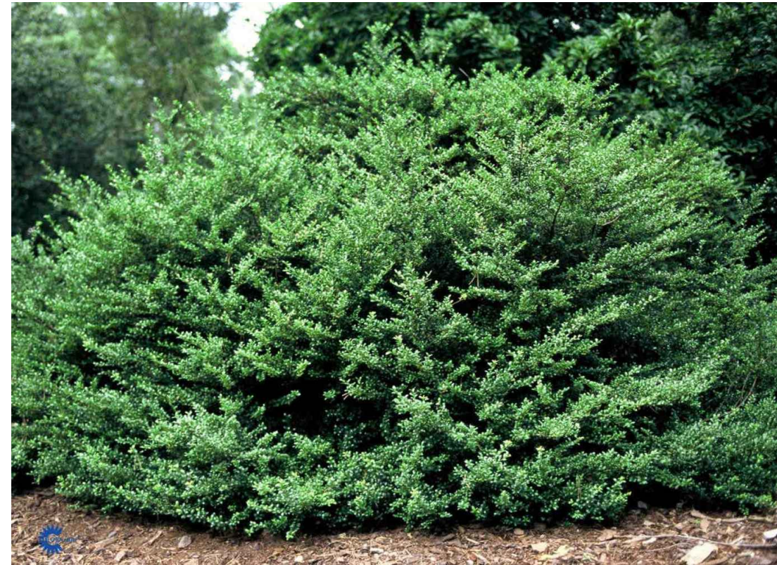
ILEX CRENATA 'CONVEXA' CONVEX-LEAF JAPANESE HOLLY