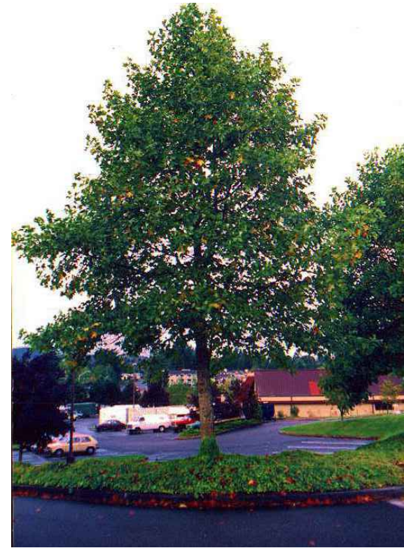
LIRIODENDRON TULIPIFERA TULIP POPLAR