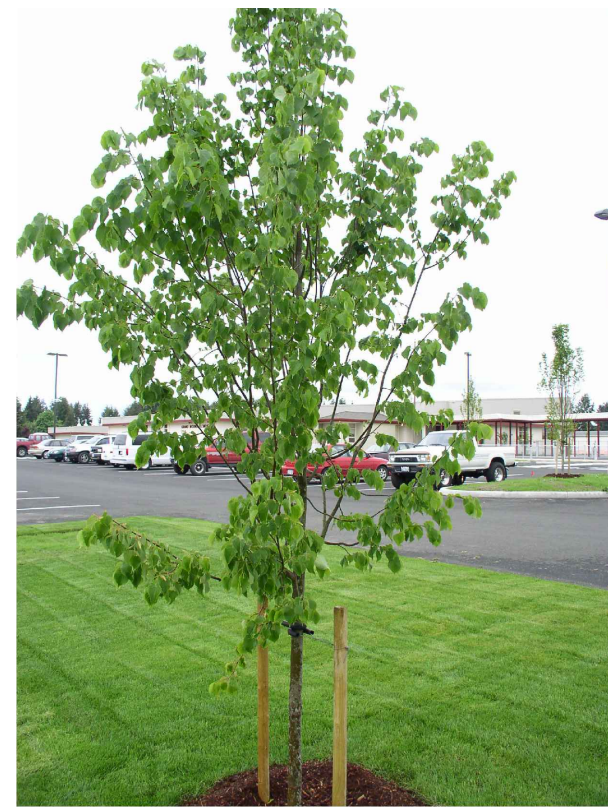
TILIA CORDATA LITTLELEAF LINDEN