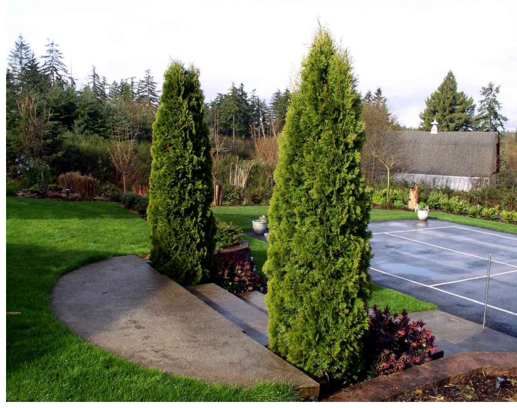
THUJA OCCIDENTALIS 'GLOBOSA' GLOBOSE ARBORVITAE