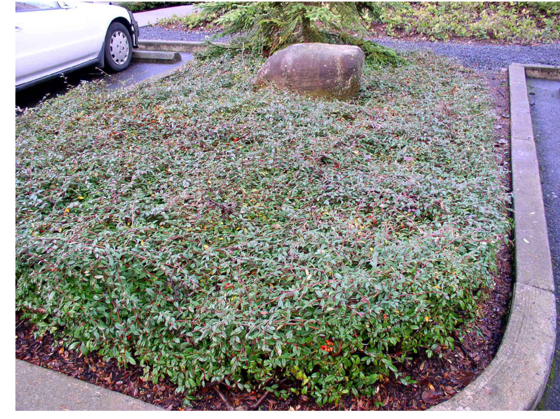
SALICIFOLIUS 'REPANDENS' WILLOWLEAF COTONEASTER