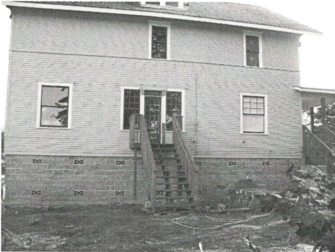
Left Side View 9-18-13