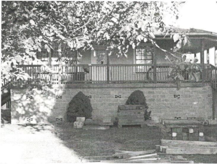
Front Side View 9-18-13

If using the Elevation Certificate to obtain NFIP flood insurance, affix at least 2 building photographs below according to the instructions for Item A6. Identify all photographs with date taken; "Front View" and "Rear View"; and, if required, "Right Side View" and "Left Side View." When applicable, photographs must show the foundation with representative examples of the flood openings or vents, as indicated in Section A8. If submitting more photographs than will fit on this page, use the Continuation Page.