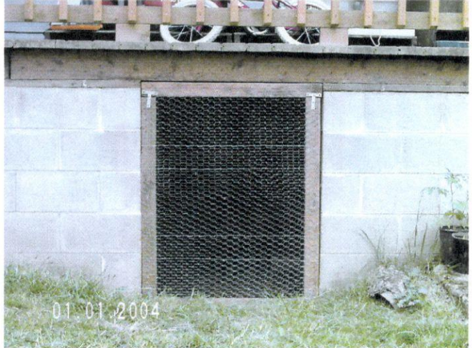
(Date on Photo incorrect) 7-22-08 CRAWL SPACE ACCESS