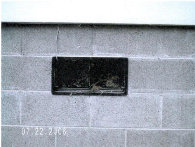
CRAWL SPACE VENT