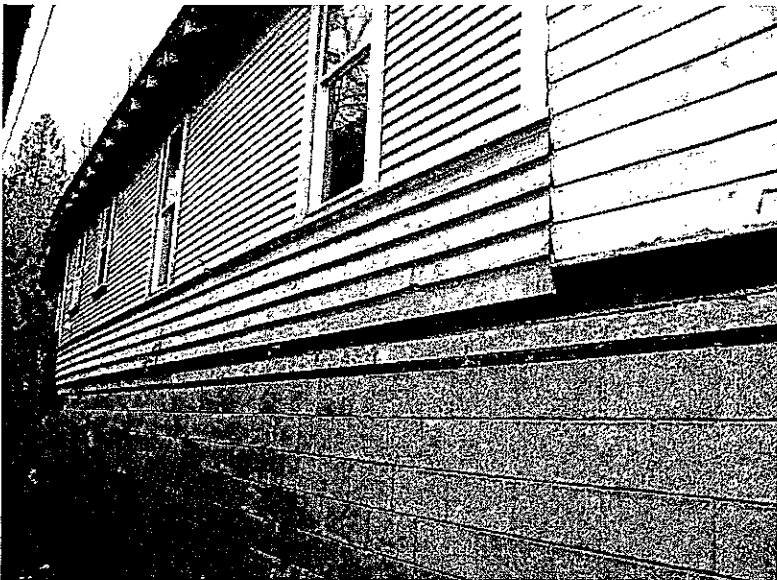
Right Side View 12-31-13