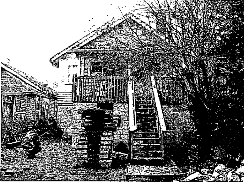
Rear View 12-31-13

If submitting more photographs than will fit on the preceding page, affix the additional photographs below. Identify all photographs with: date taken; "Front View" and "Rear View"; and, if required, "Right Side View" and "Left Side View." When applicable, photographs must show the foundation with representative examples of the flood openings or vents, as indicated in Section A8.