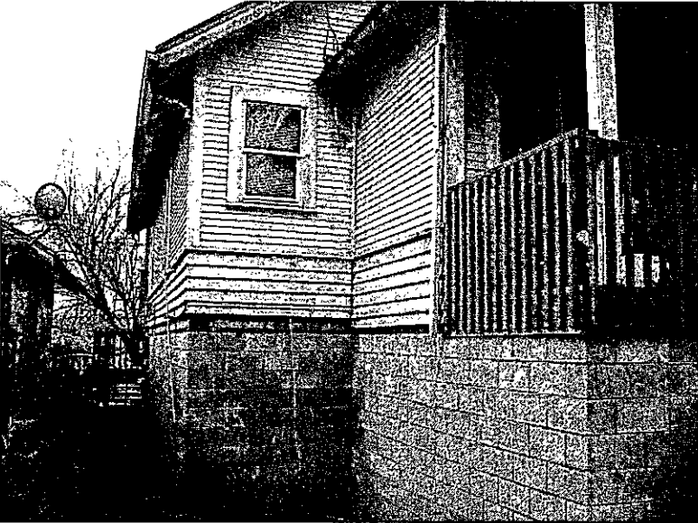
Left Side View 12-31-13