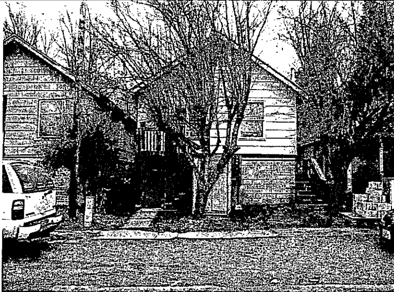
Front View 12-30-13

If using the Elevation Certificate to obtain NFIP flood insurance, affix at least 2 building photographs below according to the instructions for Item A6. Identify all photographs with date taken; "Front View" and "Rear View"; and, if required, "Right Side View" and "Left Side View." When applicable, photographs must show the foundation with representative examples of the flood openings or vents, as indicated in Section A8. If submitting more photographs than will fit on this page, use the Continuation Page.