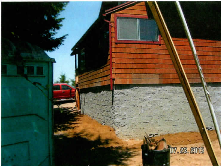
FRONT VIEW FROM SW

If using the Elevation Certificate to obtain NFIP flood insurance, affix at least 2 building photographs below according to the instructions for Item A6. Identify all photographs with date taken; "Front View" and "Rear View"; and, if required, "Right Side View" and "Left Side View." When applicable, photographs must show the foundation with representative examples of the flood openings or vents, as indicated in Section A8. If submitting more photographs than will fit on this page, use the Continuation Page.