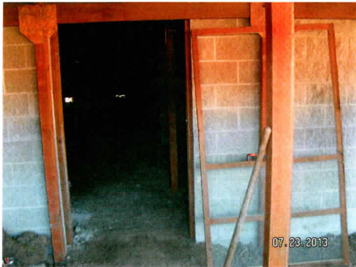
CRAWL SPACE ACCESS (SCREENED DOOR TO THE RIGHT WILL BE INSTALLED)