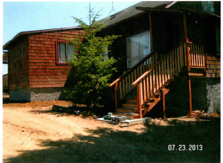
FRONT VIEW FROM NW