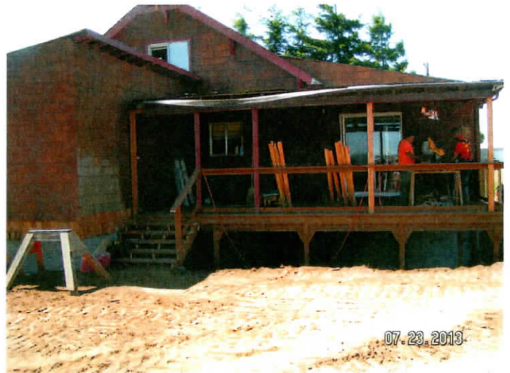
REAR VIEW FROM EAST SIDE