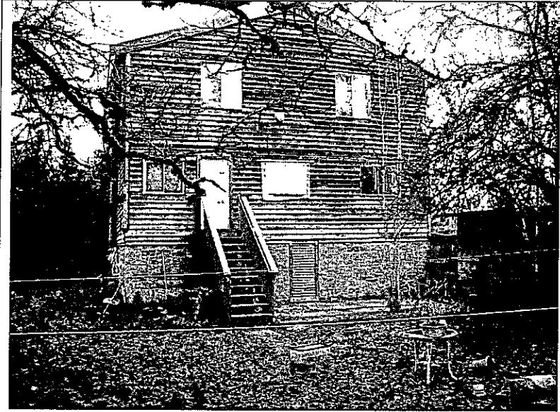
Rear View 12-31-13

If submitting more photographs than will fit on the preceding page, affix the additional photographs below. Identify all photographs with: date taken; "Front View" and "Rear View"; and, if required, "Right Side View" and "Left Side View." When applicable, photographs must show the foundation with representative examples of the flood openings or vents, as indicated in Section A8.