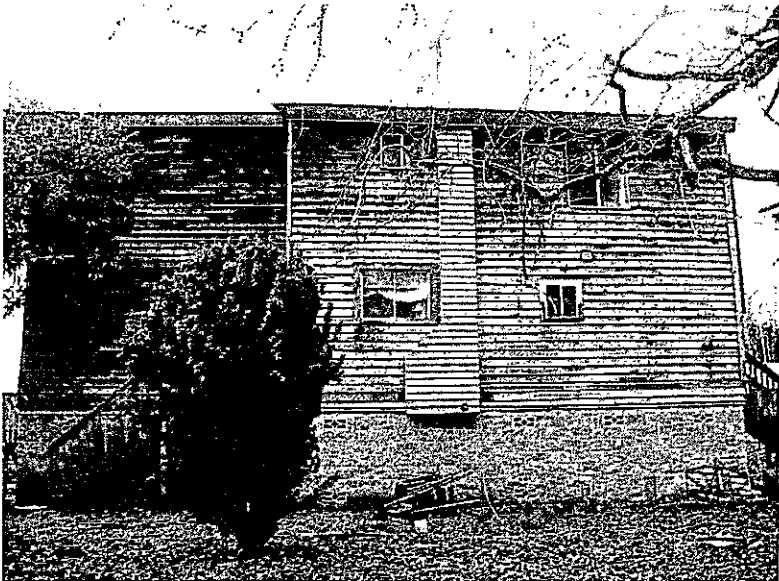
Right Side View 12-31-13