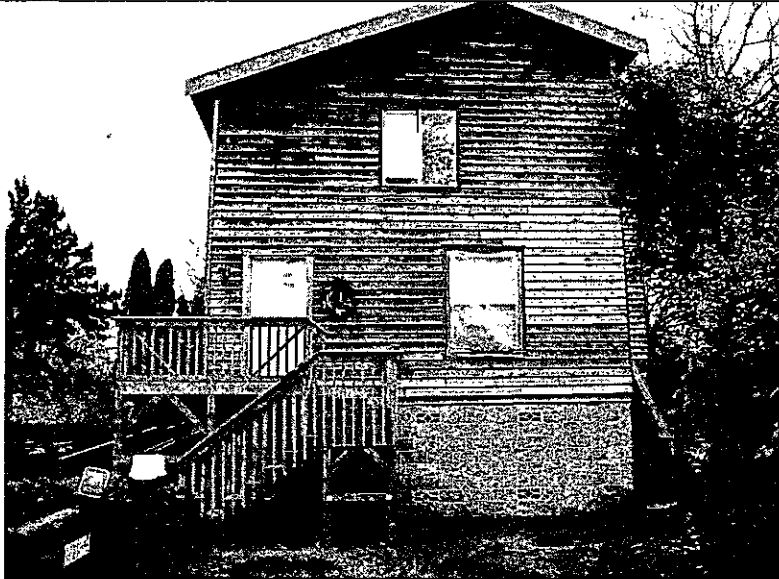
Front View 12-30-13

If using the Elevation Certificate to obtain NFIP flood insurance, affix at least 2 building photographs below according to the instructions for Item A6. Identify all photographs with date taken; "Front View" and "Rear View"; and, if required, "Right Side View" and "Left Side View." When applicable, photographs must show the foundation with representative examples of the flood openings or vents, as indicated in Section A8. If submitting more photographs than will fit on this page, use the Continuation Page.