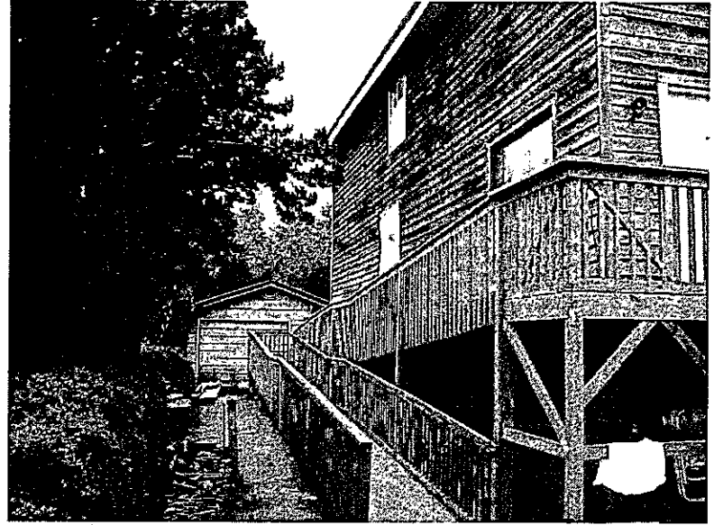
Left Side View 12-31-13