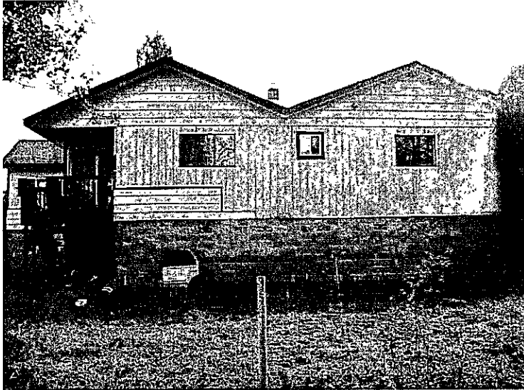
Rear View 9-18-13

If submitting more photographs than will fit on the preceding page, affix the additional photographs below. Identify all photographs with: date taken; "Front View" and "Rear View"; and, if required, "Right Side View" and "Left Side View." When applicable, photographs must show the foundation with representative examples of the flood openings or vents, as indicated in Section A8.