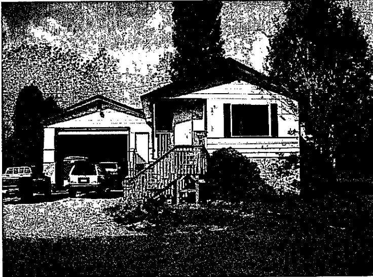
Front Side View 9-18-13

If using the Elevation Certificate to obtain NFIP flood insurance, affix at least 2 building photographs below according to the instructions for Item A6. Identify all photographs with date taken; "Front View" and "Rear View"; and, if required, "Right Side View" and "Left Side View." When applicable, photographs must show the foundation with representative examples of the flood openings or vents, as indicated in Section A8. If submitting more photographs than will fit on this page, use the Continuation Page.