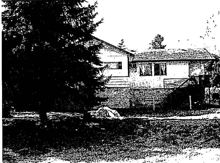
Left Side View 9-18-13