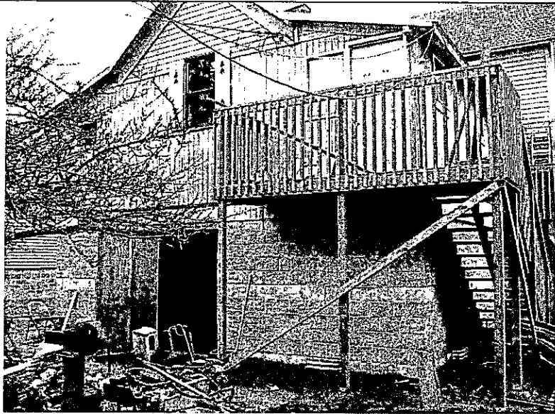
Rear View 12-31-13

If submitting more photographs than will fit on the preceding page, affix the additional photographs below. Identify all photographs with: date taken; "Front View" and "Rear View"; and, if required, "Right Side View" and "Left Side View." When applicable, photographs must show the foundation with representative examples of the flood openings or vents, as indicated in Section A8.