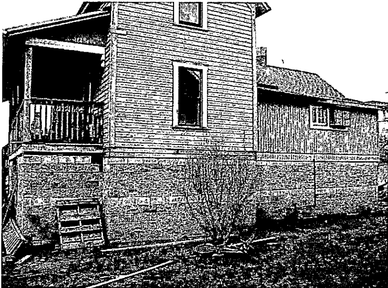
Right Side View 12-31-13