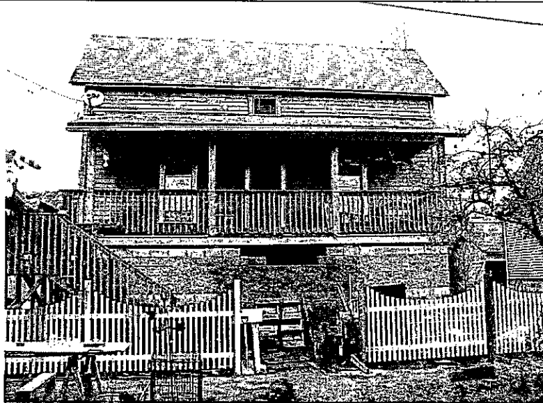
Front View 12-30-13

If using the Elevation Certificate to obtain NFIP flood insurance, affix at least 2 building photographs below according to the instructions for Item A6. Identify all photographs with date taken; "Front View" and "Rear View"; and, if required, "Right Side View" and "Left Side View." When applicable, photographs must show the foundation with representative examples of the flood openings or vents, as indicated in Section A8. If submitting more photographs than will fit on this page, use the Continuation Page.