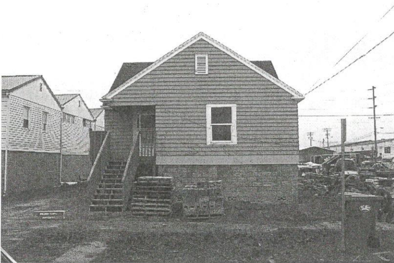
Front View 12-30-13

If using the Elevation Certificate to obtain NFIP flood insurance, affix at least 2 building photographs below according to the instructions for Item A6. Identify all photographs with date taken; "Front View" and "Rear View"; and, if required, "Right Side View" and "Left Side View." When applicable, photographs must show the foundation with representative examples of the flood openings or vents, as indicated in Section A8. If submitting more photographs than will fit on this page, use the Continuation Page.