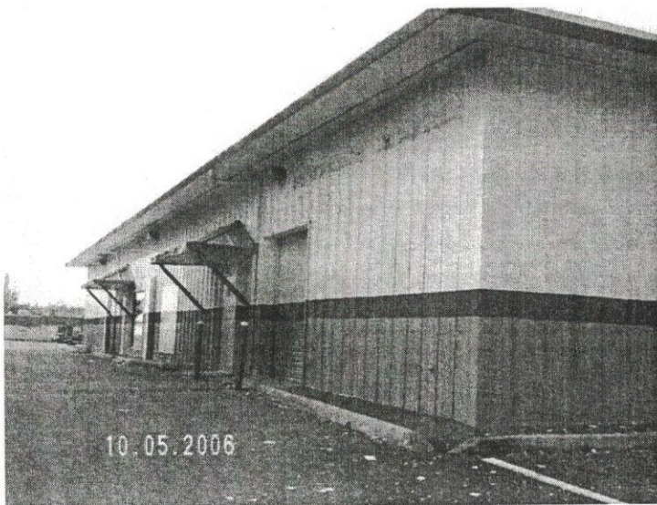
SOUTH SIDE OF BUILDING