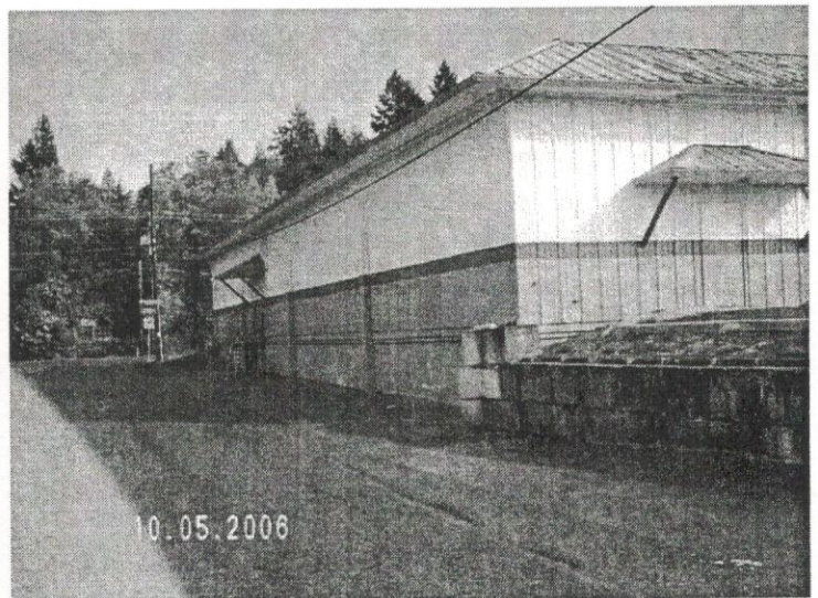
NORTH SIDE - "NE SCOTT JOHNSON ROAD"