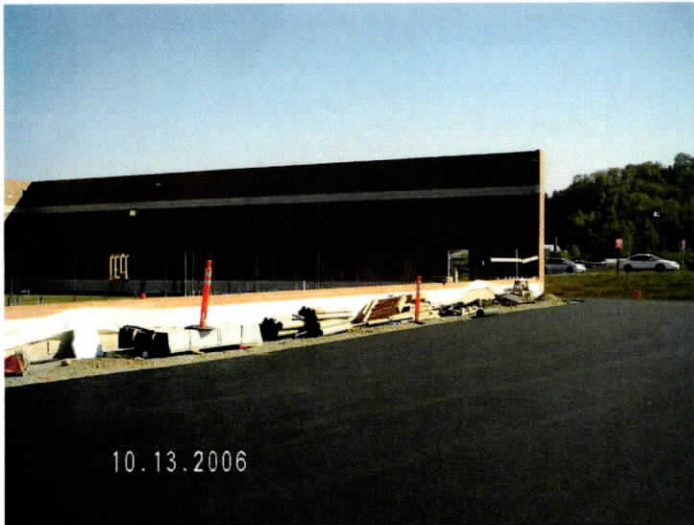
SOUTH SIDE LOOKING NE

If using the Elevation Certificate to obtain NFIP flood insurance, affix at least two building photographs below according to the instructions for Item A6. Identify all photographs with: date taken; "Front View" and "Rear View"; and, if required, "Right Side View" and "Left Side View." If submitting more photographs than will fit on this page, use the Continuation Page, following.