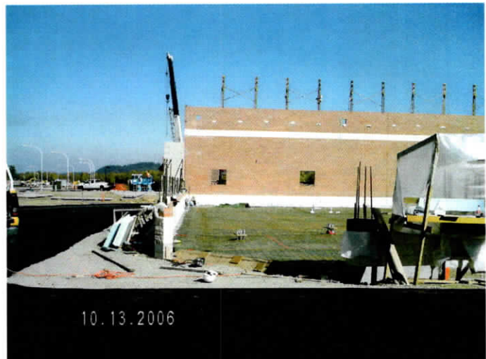
WEST BUILDING WALL AND SUB-FLOOR