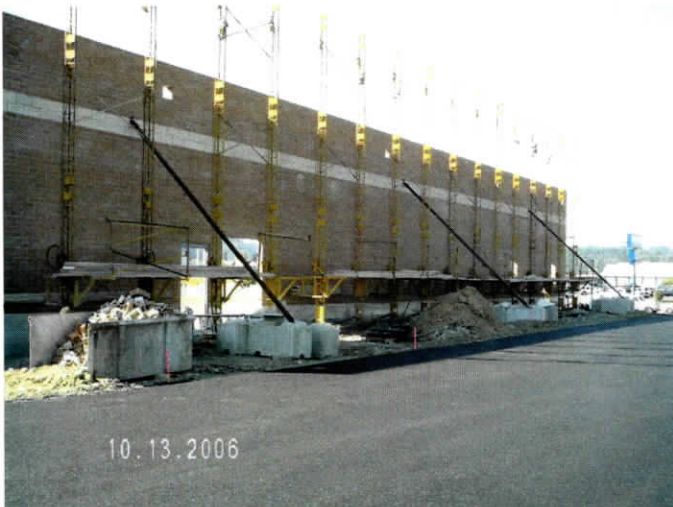
NORTH SIDE LOOKING EAST