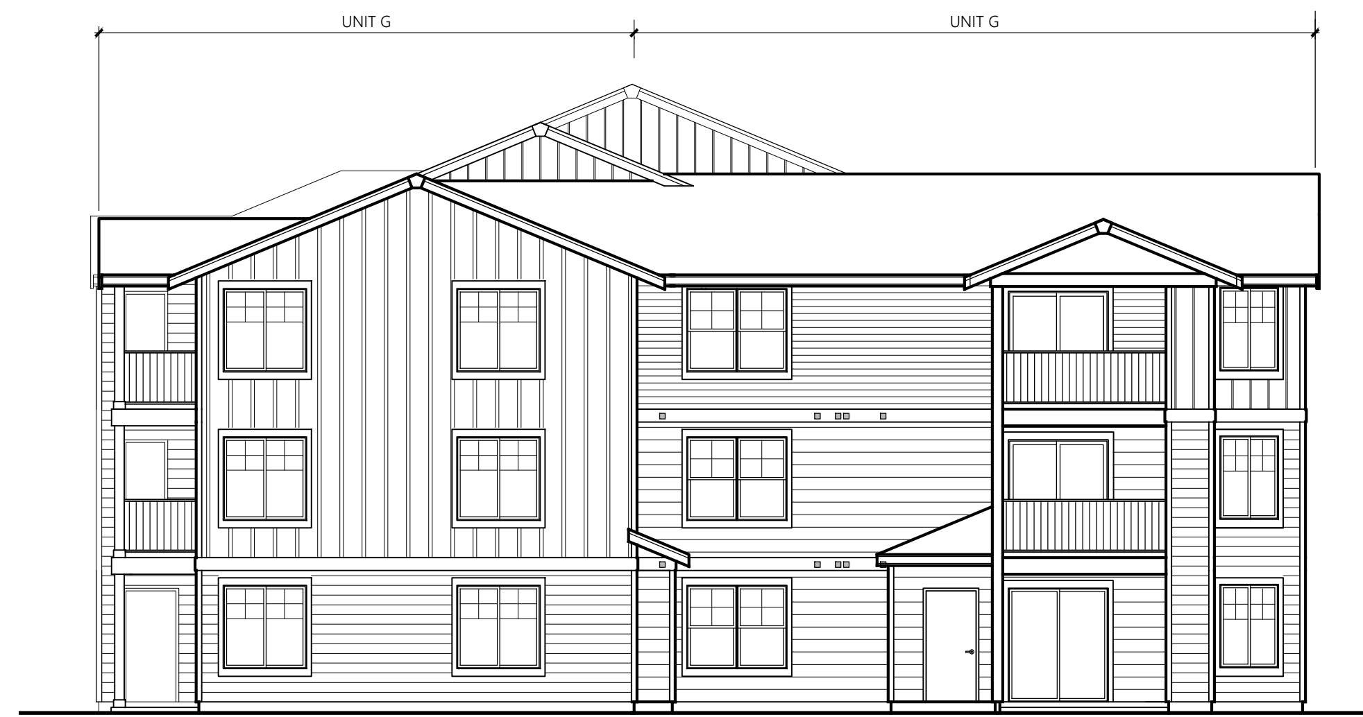
BUILDING TYPE 2