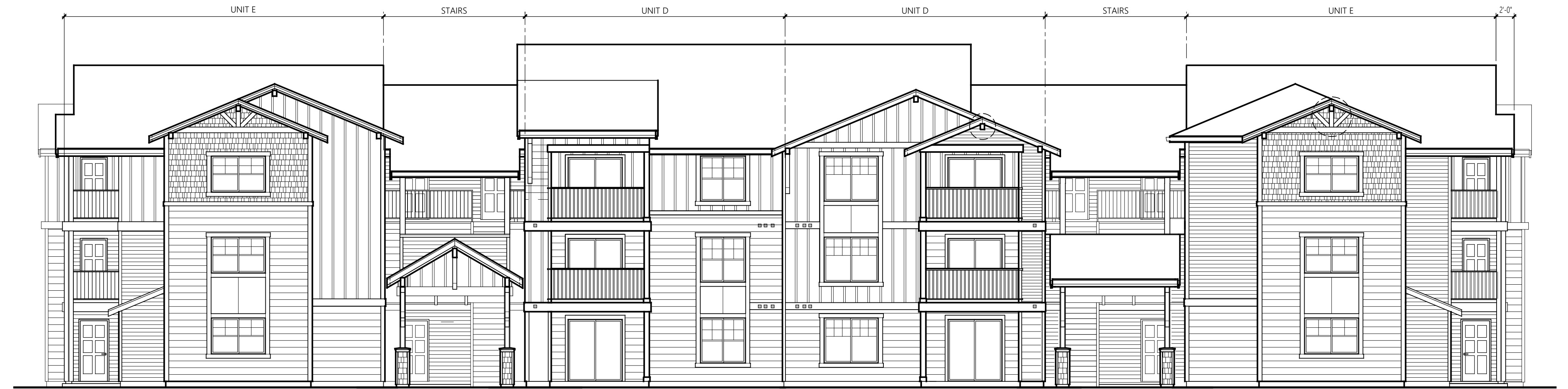
BUILDING TYPE 1