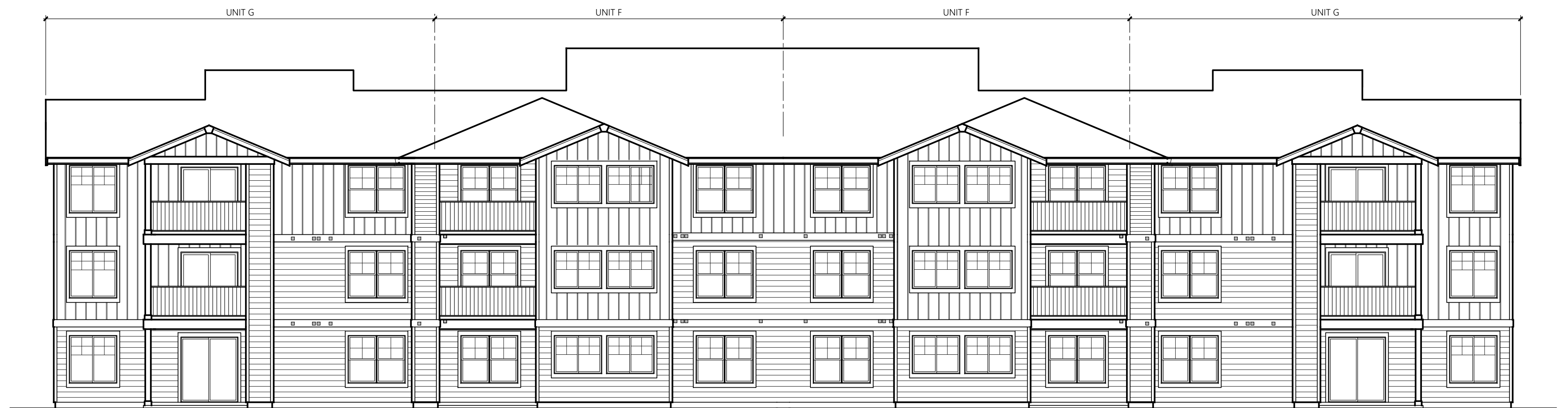
BUILDING TYPE 2