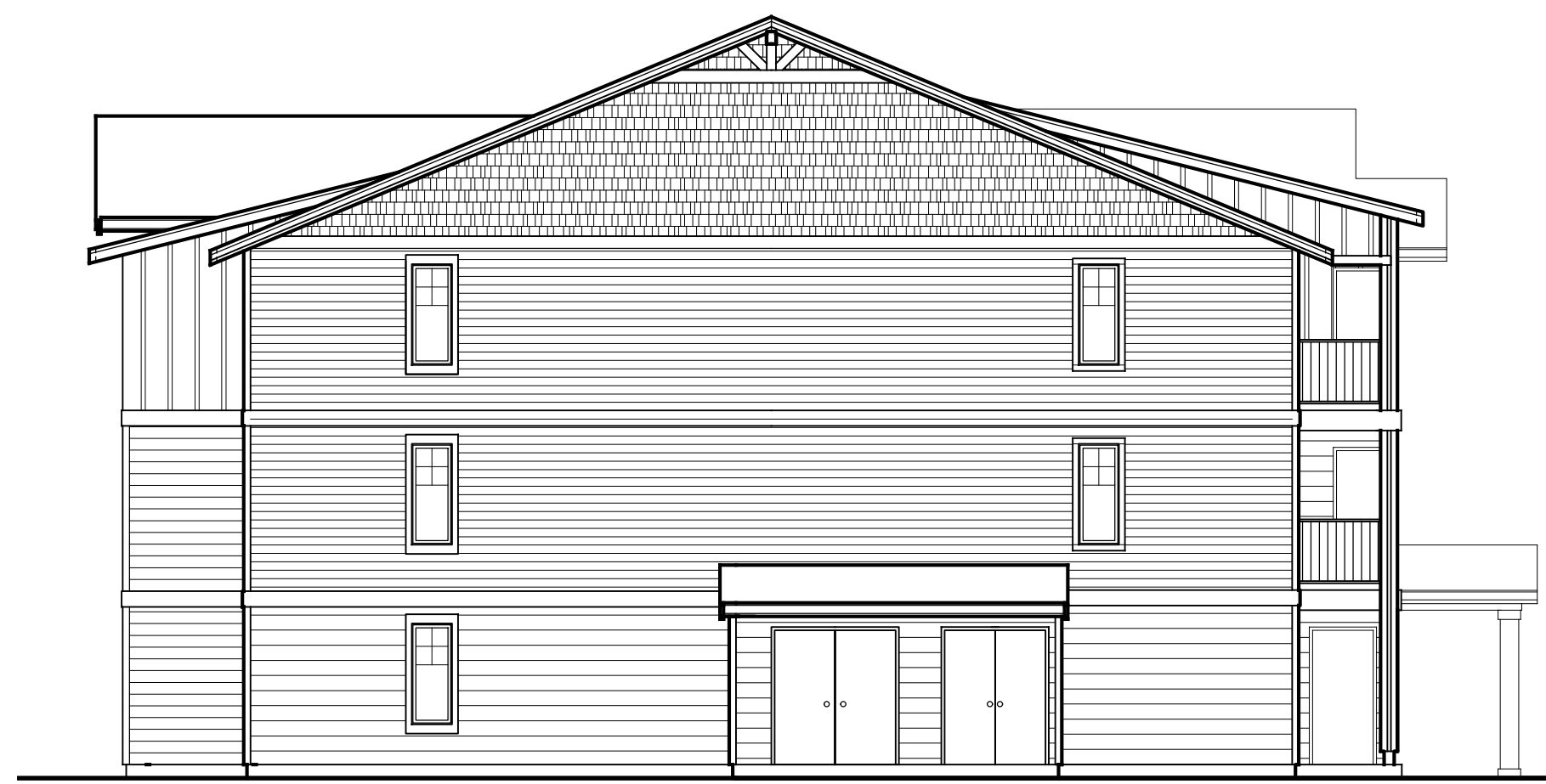
BUILDING TYPE 3