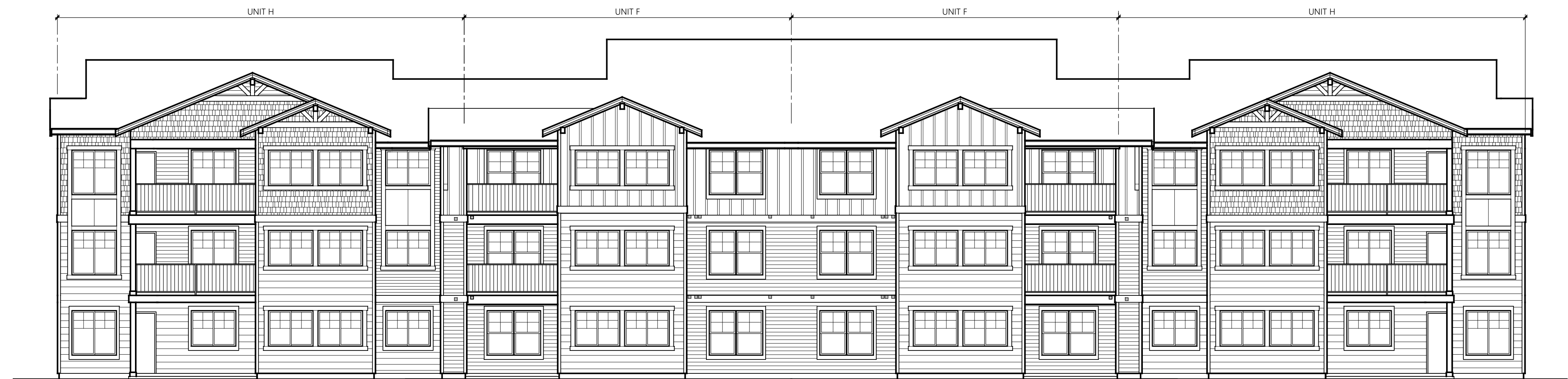
BUILDING TYPE 1