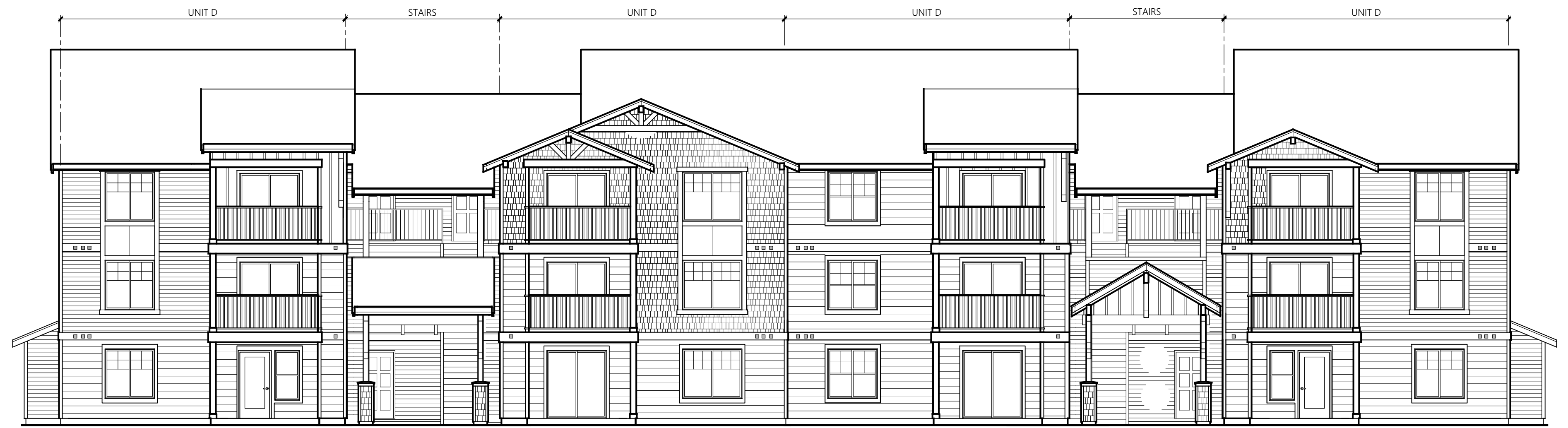
BUILDING TYPE 3