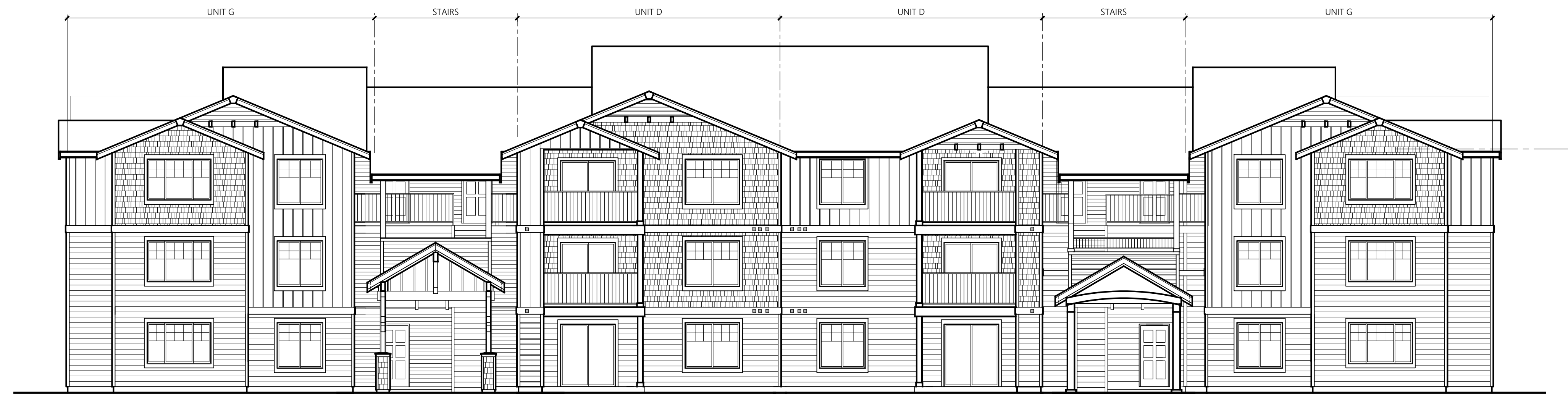
BUILDING TYPE 2