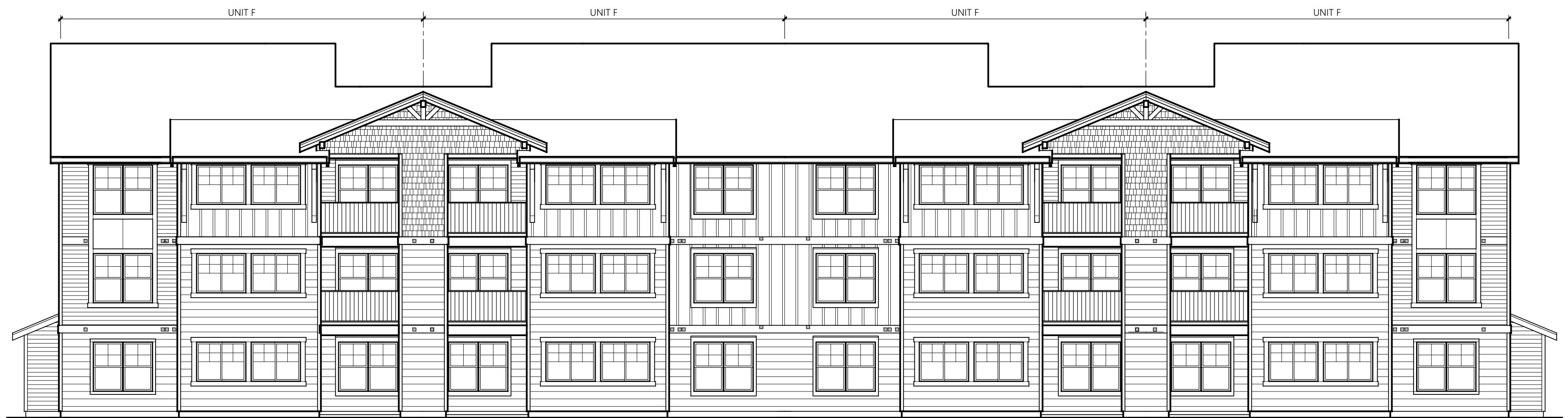
BUILDING TYPE 3