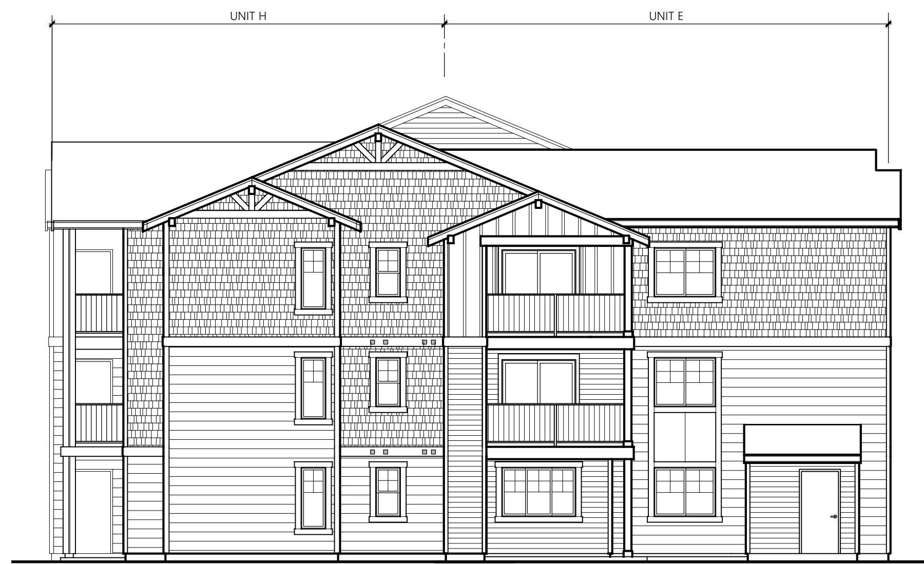
BUILDING TYPE 1