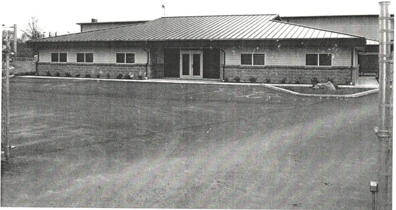
CONTROL BUILDING – FRONT VIEW – MARCH 26, 2007