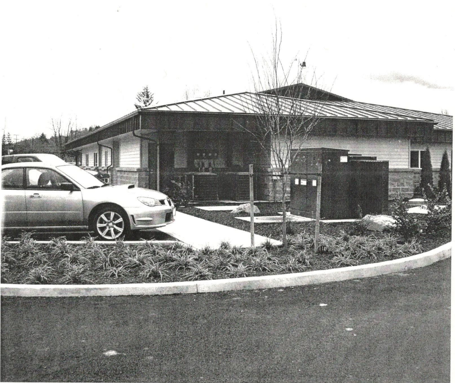
CONTROL BUILDING - LEFT SIDE VIEW - MARCH 26, 2007