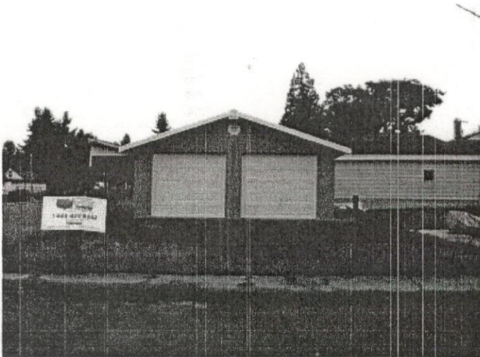
Northerly side of garage