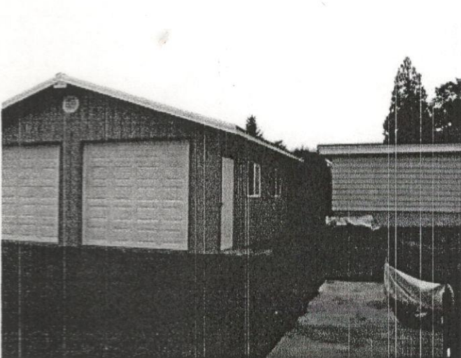
Westerly Side of garage.