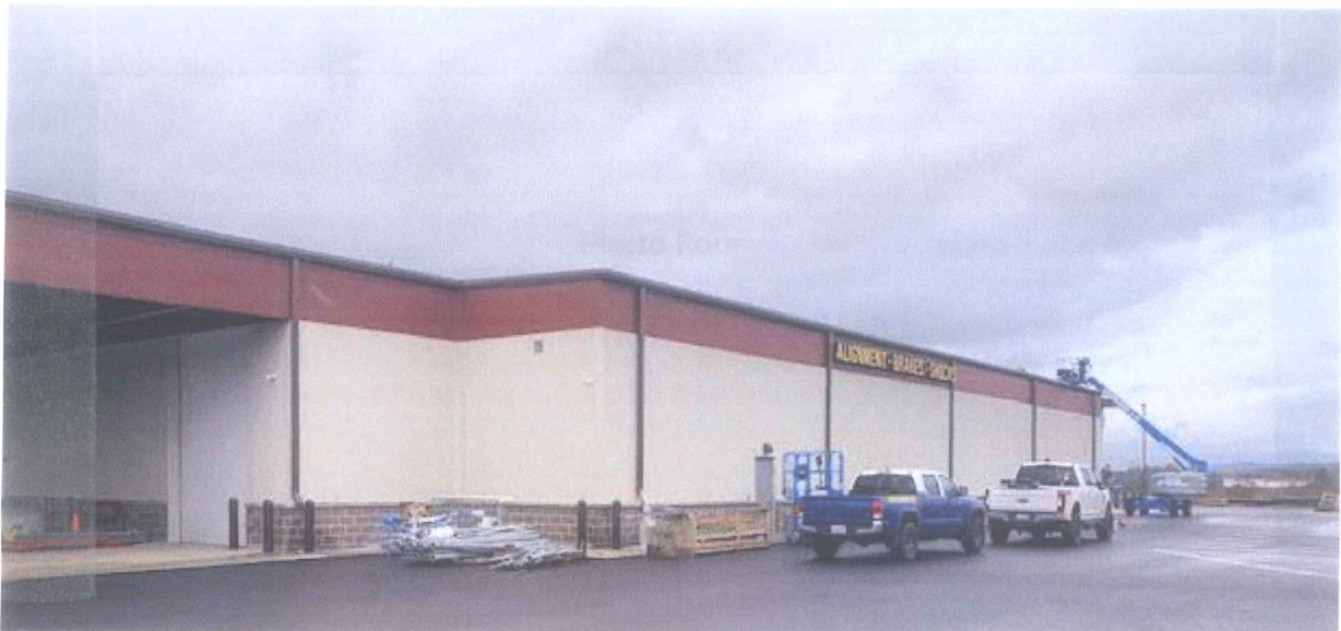
Photo Four Caption REAR