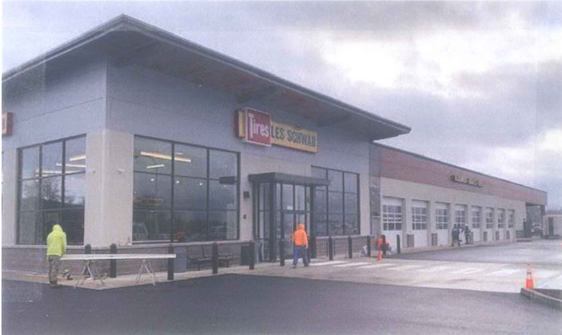
Photo Three Caption FRONT

If submitting more photographs than will fit on the preceding page, affix the additional photographs below. Identify all photographs with: date taken; "Front View" and "Rear View"; and, if required, "Right Side View" and "Left Side View." When applicable, photographs must show the foundation with representative examples of the flood openings or vents, as indicated in Section A8.