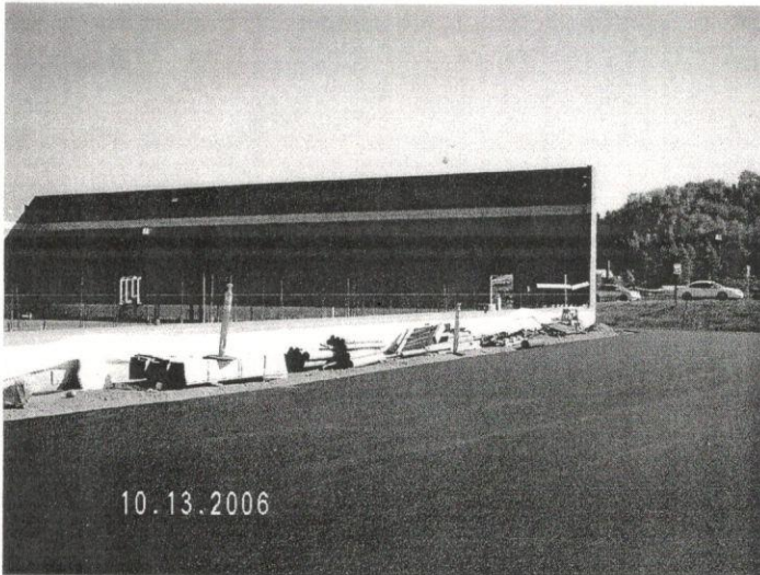
SOUTH SIDE LOOKING NE

If using the Elevation Certificate to obtain NFIP flood insurance, affix at least two building photographs below according to the instructions for Item A6. Identify all photographs with: date taken; "Front View" and "Rear View"; and, if required, "Right Side View" and "Left Side View." If submitting more photographs than will fit on this page, use the Continuation Page, following.