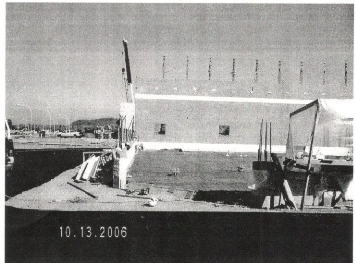
WEST BUILDING WALL AND SUB-FLOOR