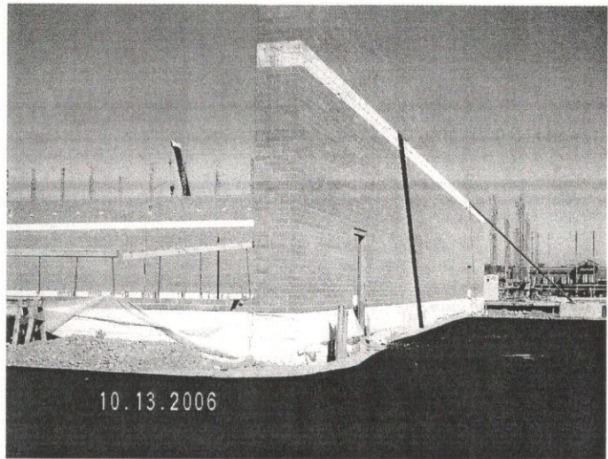
EAST SIDE LOOKING NORTH